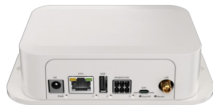
Edge IoT Gateway: Front Panel (IoT Compact Extended BLE + LTE)