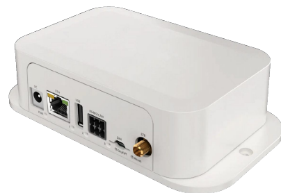
Edge IoT Gateway (IoT Compact Extended BLE + LTE)