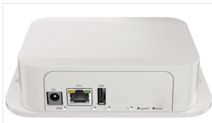
Edge IoT Gateway: Front Panel (IoT Compact BLE)